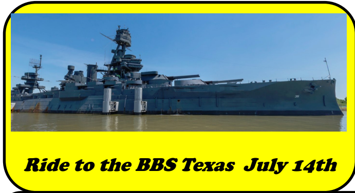
Ride to the BBS Texas July 14th